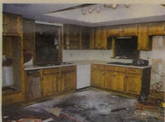
FAR LEFT: Old cabinets from a demolished wall were used to create the new center island.